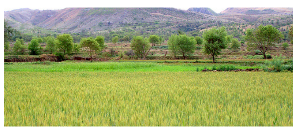
Copyright © 2009, CMS Computers Ltd. All rights reserved. The trademarks identified herein are the trademarks or registered trademarks of CMS Computers Ltd. or other third party.